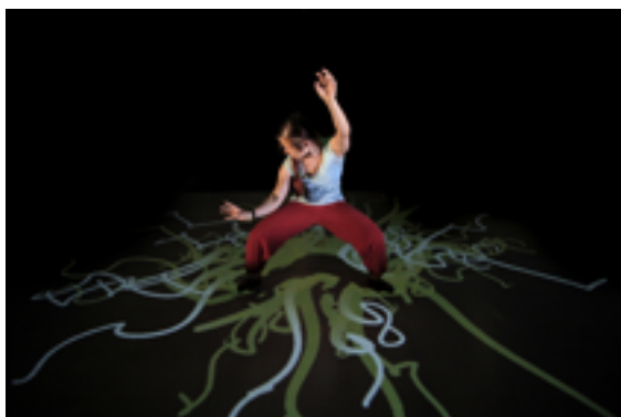
Scotty Harburg and Ville Lindsten perform with the robot arm