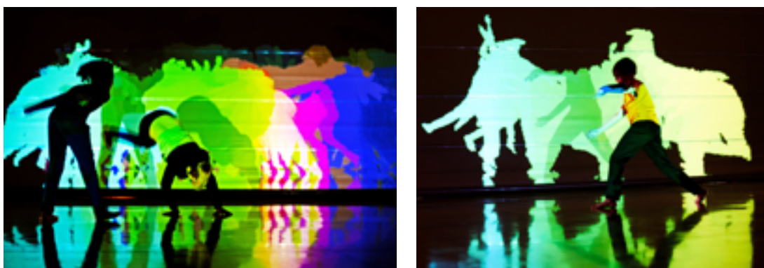
(DigiDance workshops in Kirkonkylän koulu in Oulunsalo)

TaikaBox ry led 17 DigiDance workshop days in different parts of Finland. Five workshops out of these took place in Oulu and the rest in its surrounding regions, as well as in Ostrobothnia and Lapland. The association led also a four-hour DigiDance Open Space event as part of Young Arts Night at VanAbbe Art Museum in Eindhoven in the Netherlands. In 2018, TaikaBox ry's DigiDance workshops gained over 1614 participants. The workshops combine creative movement and interactive projection. Due to an increasing demand TaikaBox ry is aiming to train two young artists to lead workshops in 2019.